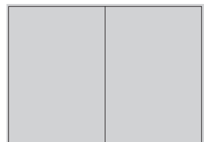
Double Page Spread

For legibility, we recommend that any text for the Full Page or Double Page Spread advertisements is placed at least 10mm from the top, bottom and outside edges of the artwork and at least 20mm from the edge nearest the spine.